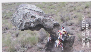
The Woman Who Turned to Stone.